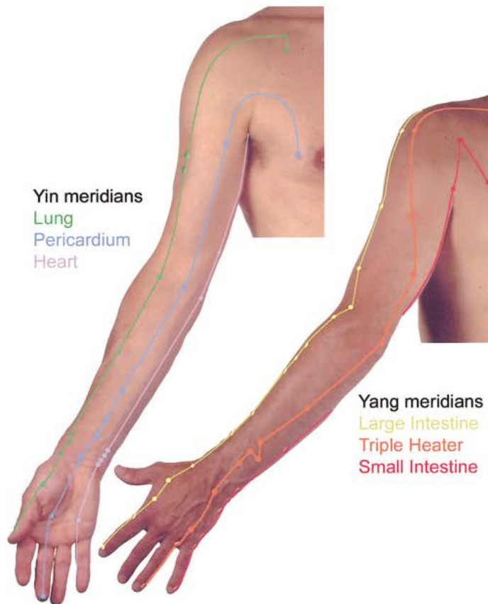
Figure 1. Acupuncture meridians of the arm. Acupuncture points were located by palpation in a living subject, according to anatomical guidelines provided in a major reference acupuncture textbook (Cheng, 1987). Connective tissue planes associated with Yin meridians are more inward and deep, compared with the generally outward and superficial planes associated with Yang meridians.

balance between different parts of the body. Acupuncture points are mostly located along the meridians, although “extra” points outside the meridian system are also believed to exist. Although acupuncture texts and atlases generally agree on the location of the principal meridians, considerable variability exists as to the number and location of internal branches and extra points.