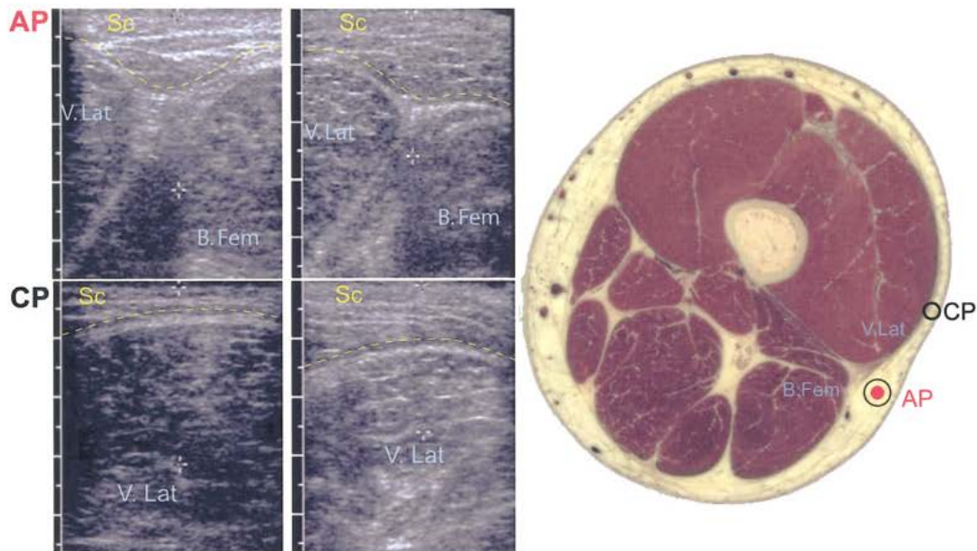
Figure 3. Ultrasound imaging of acupuncture (AP) and control (CP) points. Acupuncture point GB32 was located by palpation in two normal human volunteers, as well as a control point located 3 cm away from the acupuncture point. After marking both points with a skin marker, ultrasound imaging was performed with an Acuson ultrasound machine equipped with a 7 MHz linear probe. A visible connective tissue intramuscular cleavage plane can be seen at acupuncture points but not at control points. V.Lat, vastus lateralis; B.Fem, biceps femoris; Sc, subcutaneous tissue.

the fascial plane separating the vastus lateralis and biceps femoris muscles. The control point, located 3 cm away from the acupuncture point, is located over the belly of the vastus lateralis muscle.